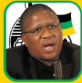
Comrade Fikile Mbalula

National Assembly, 02 June 2021 @ 14h00 Live on Channel 408