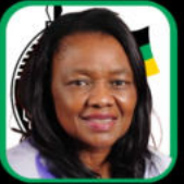
Cde Prof Hlengiwe Mkhize

National Assembly, 02 June 2021 @ 14h00 Live on Channel 408