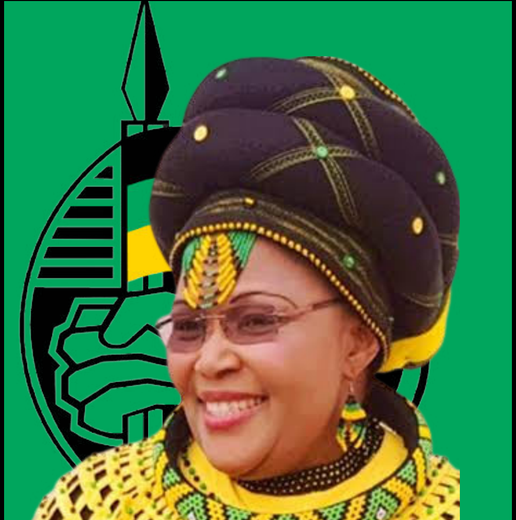
ANC CHIEFWHIP HON. PEMMY MAJODINA

We further end this term with the adoption of The Special Appropriation Bill and the Appropriation Bill, which were tabled by the Minister of Finance Cde Tito Mboweni in the National Assembly earlier today. These bills are adopted in a period where our fiscus is constrained due to the economic impact that emanated from the Covid-19 pandemic and certain adjustments had to be made to accommodate critical and urgent needs and stabilize the country.