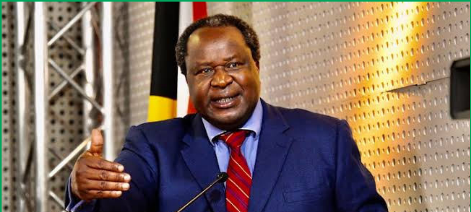
FINANCE MINISTER: HON. TITO MBOWENI