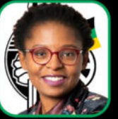
Cde Khumbuzho Ntshavheni