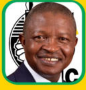
Deputy President Cde David Mabuza