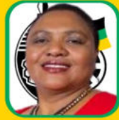
Comrade Thoko Didiza