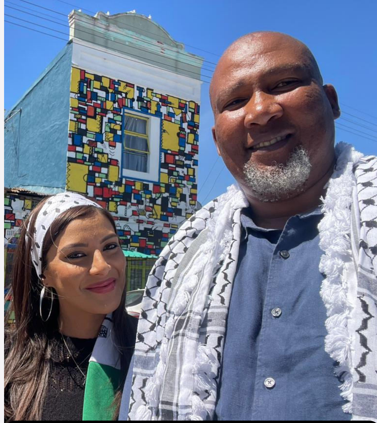
Cde Mandla Mandela

We stand with the people of Palestine. The world stood by in silence and complicity as Apartheid Israel killed thousands of Palestinians.