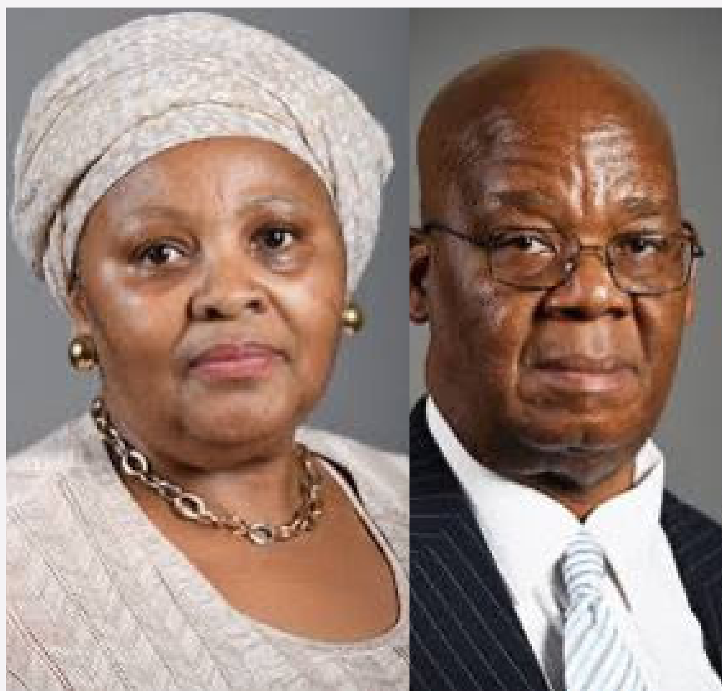
By Speaker of the NA, Cde Nosiviwe Mapisa-Nqakula & NCOP Chair, Cde Amos Masondo

"Harnessing Multilateralism and Parliamentary Diplomacy to Deepen BRICS and Africa Partnership for accelerated implementation of the Africa Free-Trade Agreement."