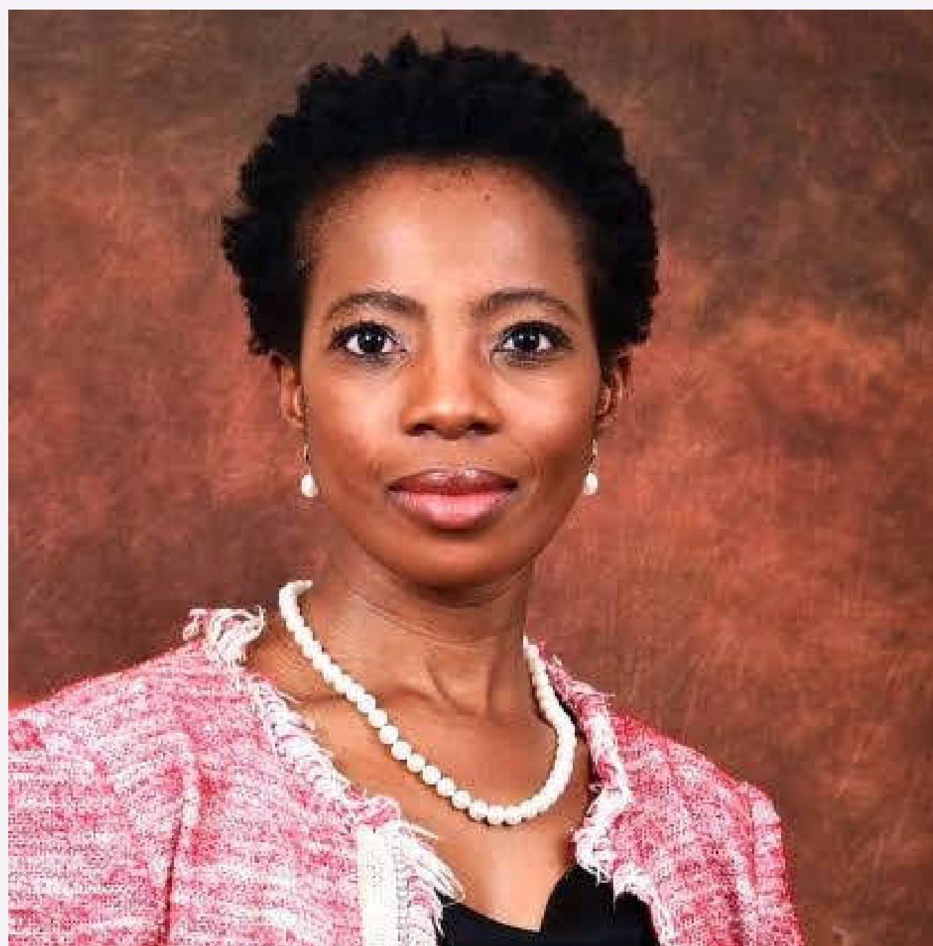
Public Protector, Kholeka Gcaleka

Today, as we optimistically celebrate the 60th Anniversary, we are reminded of the great sacrifices that our courageous forefathers have made in the fight against racism, colonialism and imperialism. We salute them for having laid the foundation for the unity of all Africans at home, and in the diaspora. The legacy of colonialism in Africa goes beyond its divisive impact, leaving behind extensive destruction and entrenching divisions such as national boundaries, linguistic divisions between Francophone and Anglophone countries, and exacerbating tribal conflicts. These persistent consequences continue to fuel civil unrest and political instability, perpetuating the cycle of regime change. The office of the Public Protector is essential in ensuring an effective public service that maintains a high standard of professional ethics and that government officials carry out their tasks effectively, fairly, and without corruption or prejudice. These same ethics should be applied at a higher standard to the individual of the Public Protector.